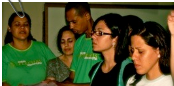
Students of the Class of 2011, at the Opening Service