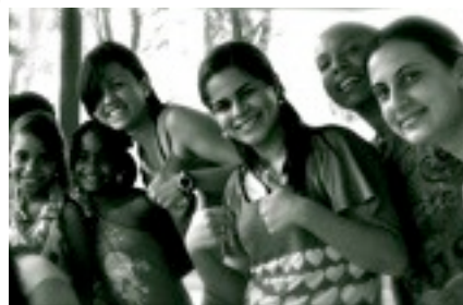
Students with some children from the congregation