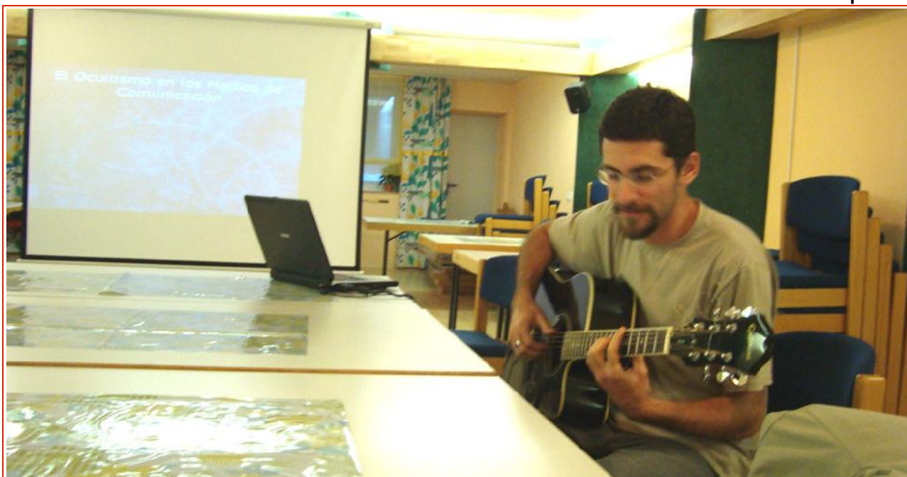
Worship during Bible Study

“Come Over ONCE AGAIN to Macedonia and Help Us”