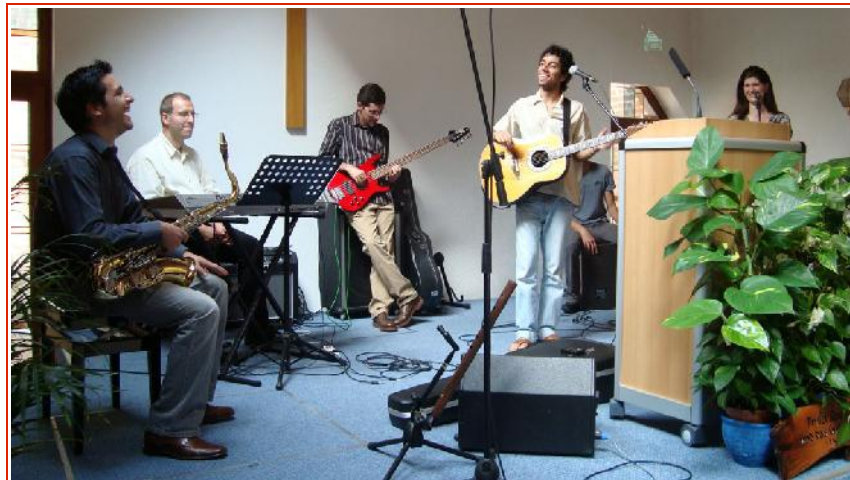
Worship Practice, a few minutes before the service

Ps: To know more about the Germany Project, please visit my blog (also in English: http://amscultori.blog.br ) and sign up to receive the latest news.