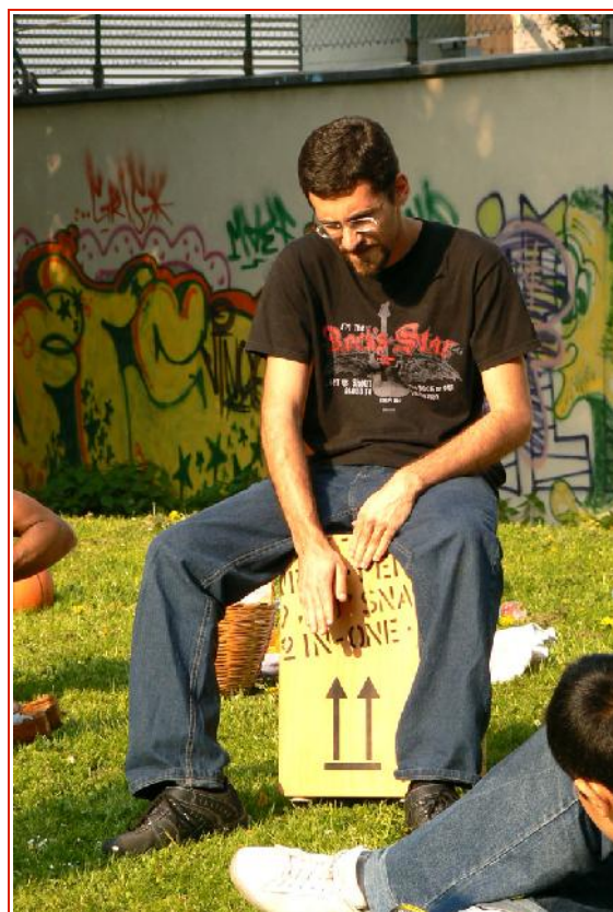
Playing the "cajon" at the church's barbecue

the church. I also took the opportunity and helped on a time of worship we had – it was great!