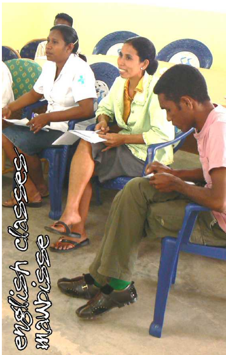
english classes maubisse

Be praying that this Conference will be a blessing, and that it may be the first of many, that will lead the Timorese Church to unity.